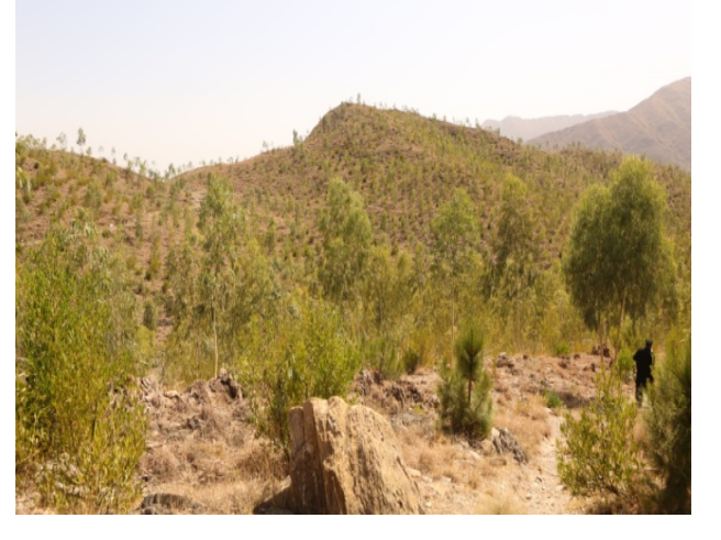
Hero Shah Plantation Area Malakand