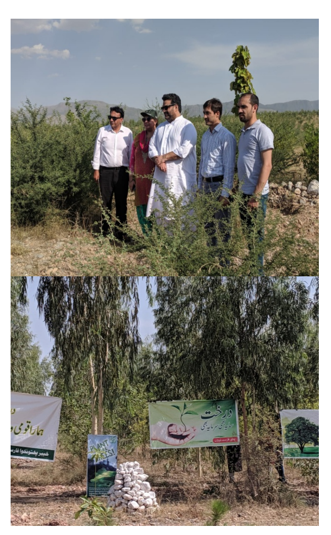
Gari Chandan Plantation Peshawar

Following the field visit, the delegation left for Mingora and halted there.