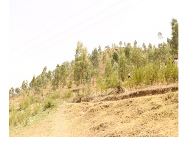
Baldhair Block Plantation Haripur