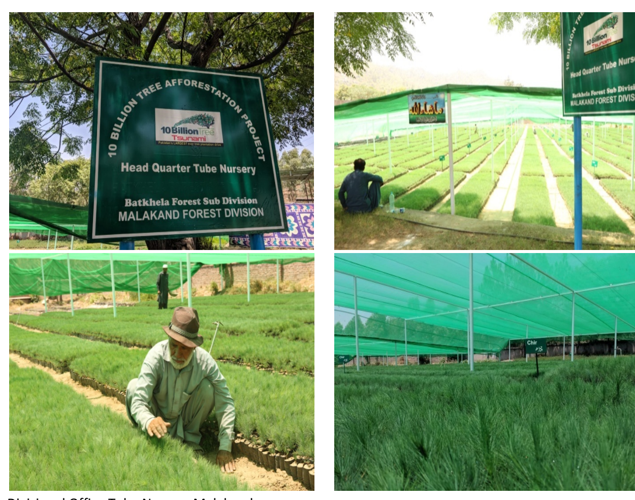
Divisional Office Tube Nursery Malakand

The delegation also visited Bare-Rooted Nursery at Sakhakot spread over an area of 2 hectares having poplar plants. Nursery was found well stocked and vigorous.