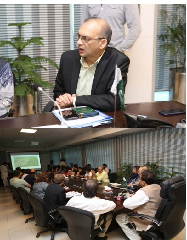
Meeting ended with vote of thanks.