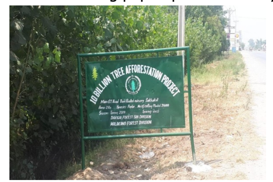
Sakhakot Bare-rooted Nursery Malakand

The delegation also visited Bare-Rooted Nursery at Sakhakot spread over an area of 2 hectares having poplar plants. Nursery was found well stocked and vigorous.