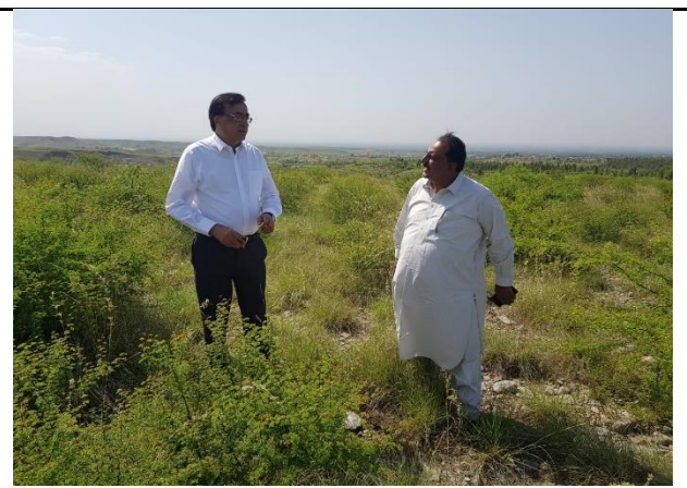
Updating Secretary Forests, Sindh by CCF