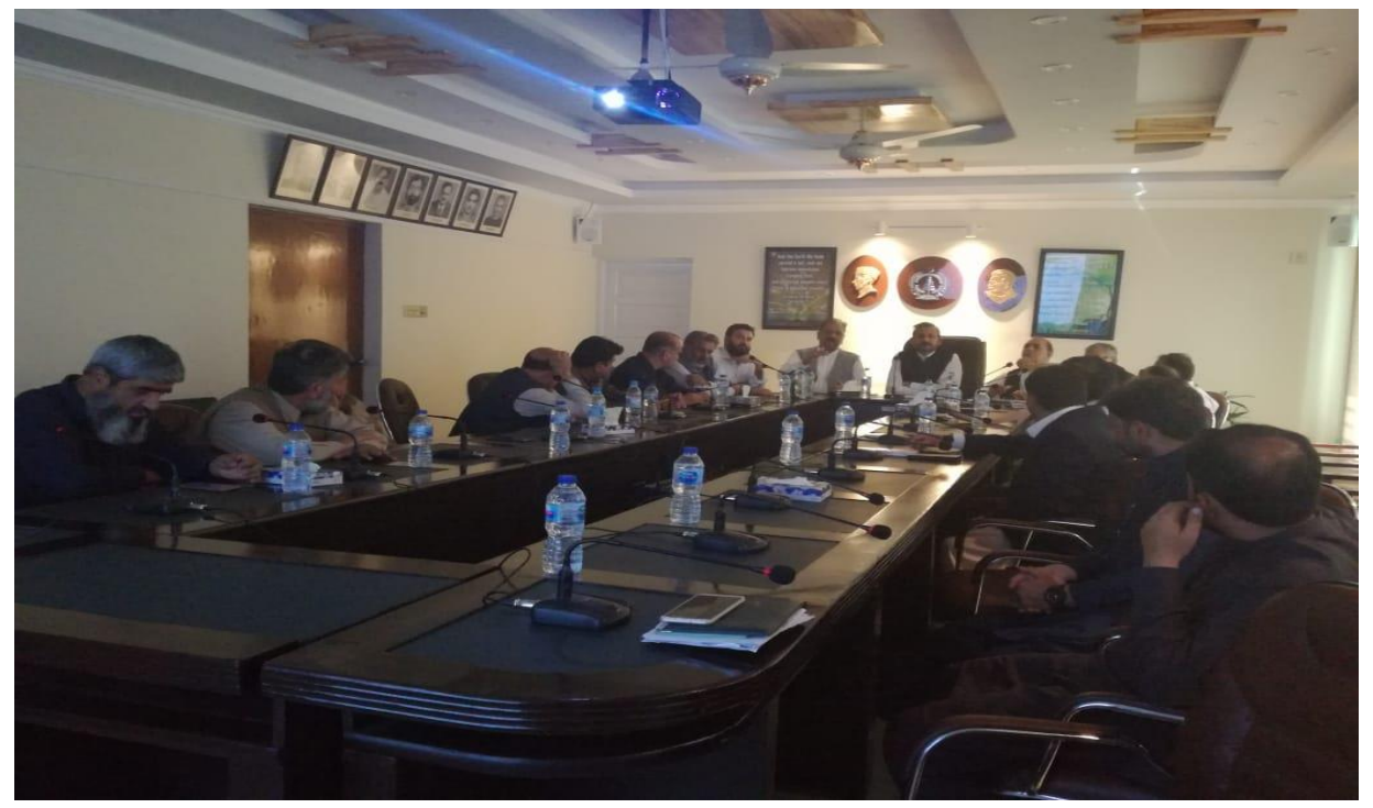
Presentation on BTAP Activities at office of CCF-Northern Forest Region (Region-II)