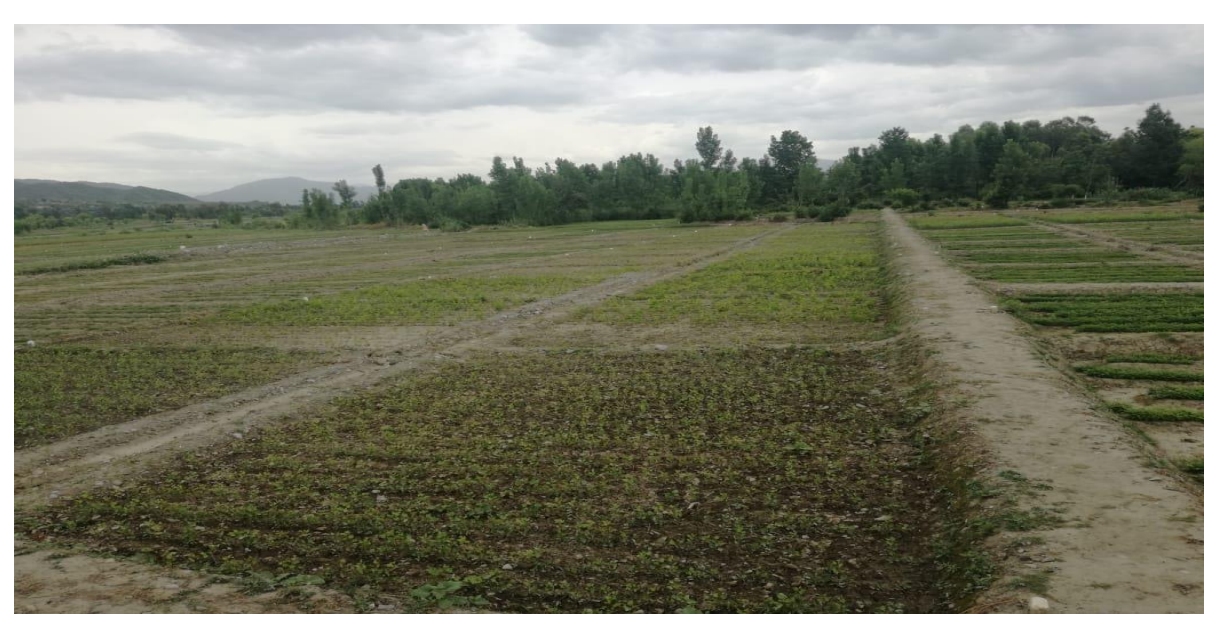
Daur Forest Division, Nika Pah Bare rooted Nurseries

different types of tree species were raised in this nursery namely Poplar, Willow, Walnut, Robinia, Ailanthus, Mulberry through various techniques including seed sowing on raised beds, dibbling and cutting on flat beds etc.